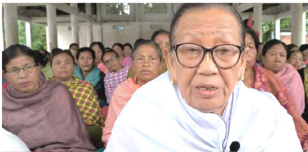
IT News Imphal, Oct 3: