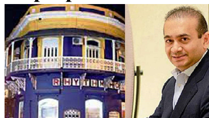
The Rhythm House in South Mumbai, one of the properties of Nirav Modi to be confiscated by the Enforcement Directorate. (Inset: Nirav Modi).