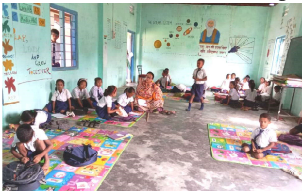
The piteous condition of the school came in the light when the volunteers of Democratic Students Alliance of Manipur (DESAM) want to inspect the school.

The scene has come out from Jirihat High school which is one of the government high school in Jiribam District. The school has no desks and benches for the students, so the pupils are bound to sit in the plastic mat for attending the classes along with the teacher. Which reminds us the ancient types of Gurukul education system in this modern age.