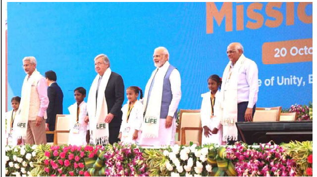
Agency New Delhi, Oct 20:

Prime Minister Narendra Modi on Thursday launched Mission LiFE (Lifestyle for Environment) in the presence of António Guterres, Secretary-General of the United Nations at the Statue of Unity, Ekta Nagar, Kevadia.