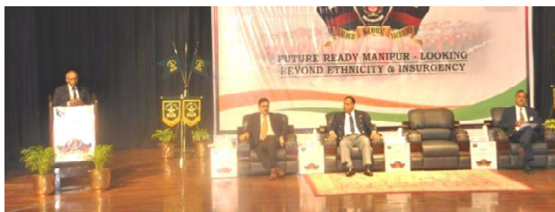
IT News Imphal, Oct 20:

The NE Seminar organised by Assam Rifles at Convention Centre raised hope & Optimism and showcased the Manipur marching beyond Ethnicity & Insurgency. It was evident from a large scale attendance in excess of 650 with over 400 youth & students besides people from all strata of society.