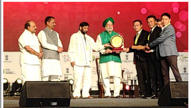
IT Correspondent Jiribam, Oct 20:

Jiribam Municipal Council received the 3rd Best Performing Municipal Council in Pradhan Mantri Awas Yojana Housing for All in India and a special award for recognition to the state with the best visibility and coverage. Yesterday,