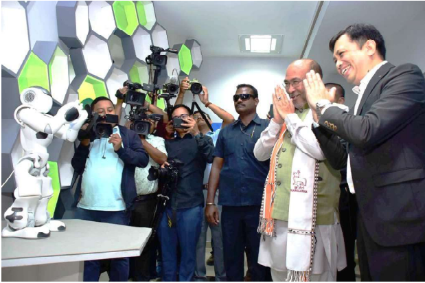
IT News Imphal, Oct 20:

Chief Minister N. Biren Singh said that he was quite impressed by the students and their projects at the "Destination Infinity – Manipur IT Startup Challenge" at the Innovation Hub, Information Technology Park, Mantripukhri today.