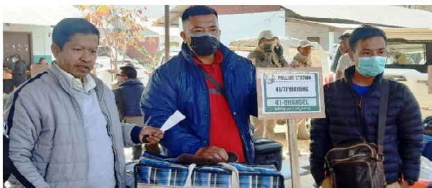
IT News Imphal, March 4:

Stage is set for the 2nd phase Manipur election in 22 assembly constituencies for the 12th Manipur Legislative Assembly election scheduled to hold tomorrow. On the same day-re-poll in 12 polling booths of 5 Assembly constituencies will also be held. All preparation has been