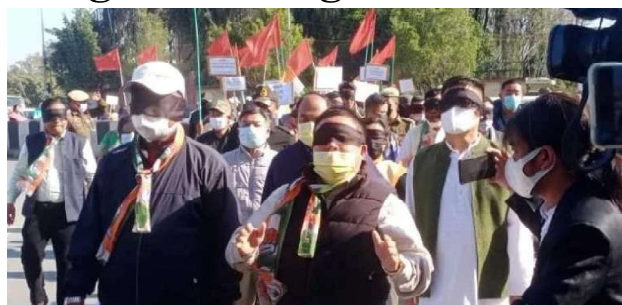
IT News Imphal, March 4:

The Manipur Pradesh Congress Committee and its alliance political party today staged a blindfold protest rally in front of the Congress Bhawan here in Imphal, alleging suppression of de-