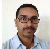
By: M.R. Lahu