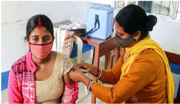
Agency New Delhi, Feb 17:

With 30,757 people testing positive for the coronavirus infection in a day, India's total tally of cases rose to 4,27,54,315, while the recovery rate crossed the 98 per cent mark again, according to Union health ministry data updated on Thursday.