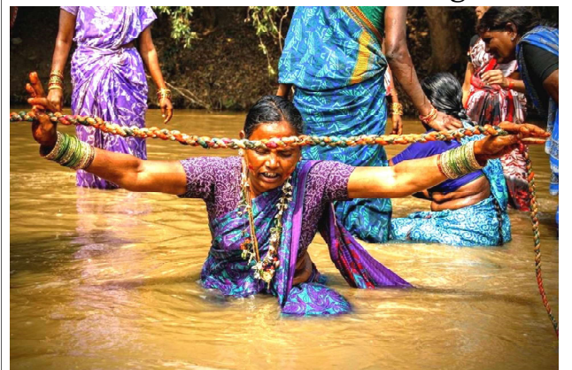
PIB New Delhi, Feb 17:

The celebrations of the First Day of the auspicious and much-awaited biennial "Medaram Jathara" commenced on the 16 th of February 2022 as the arrival of Saralamma on to the 'Medaram Gaddhe' (Platform) was undertaken by the Koya Tribe of Telangana.