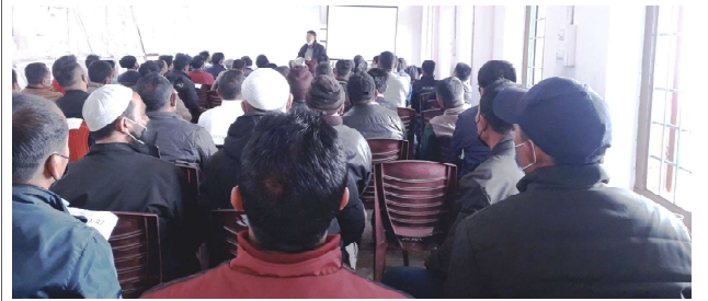
IT News Kangpokpi, Feb 17:

Training for the polling personnel for the three assembly constituencies of Kangpokpi District was conducted yesterday at the office complex of Deputy Commissioner, Kangpokpi District.