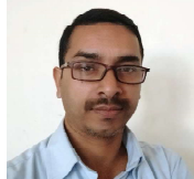
By: M.R. Lahu

Are screens effective in imparting the right kind of knowledge to the children? When it comes to the face-to-face interactions, the child has immense scope to cope up with varying life-giving tendencies and impulses which the screen normally