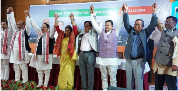
IT News Imphal, Feb 17:

Raising the bar for the battle for Manipur, the Bharatiya Janata Party on Thursday promised to establish the All India Institute of Medical Sciences (AIIMS) in Manipur if voted to power. Releasing the election manifesto at Classic Grande, Imphal, BJP national president JP Nadda also highlighted the achievements of the BJP-led coalition government in the state.