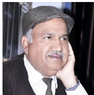
By: Vijay Garg

Women are the mirror of society. If we want to look at the condition of a society then we have to look at the condition of women there. The woman is not only an idol of struggle but also an idol of sacrifice and love. He is not only a person but also a force that destroys monsters when the time comes.