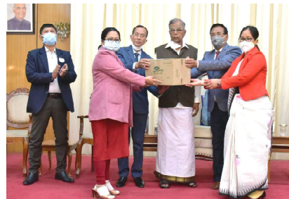
IT News Imphal, Feb 17:

Governor of Manipur La. Ganesan appealed people to understand the importance of ayurvedic medicines to prevent diseases and to enable all for a healthy living. He was speaking at the distribution function of Ayurvedic medicines kits to the employees and security personnel working in