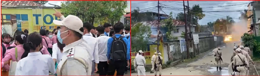
IT News Imphal, Aug 6:

The five leaders of the All Tribal Students' Union Manipur (ATSUM), arrested for conspiring the imposition of economic blockade along the National Highways, were sent to judicial custody for 15 days by the Chief Judicial Magistrate today.