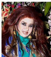
By: Shahnaz Husain

ing them according to skin colour and tone is as essential as learning the techniques of application. Your natural skin tone is most important while selecting foundations. Try to buy one that is closest to your skin colour as possible. Face powder may be of the same shade as the foundation. If you wish to tone down a tan, select a powder that is one shade lighter, but in the same colour tone.