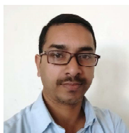
By: M.R. Lahu

As I write this, war clouds are hovering over the tiny island nation of Taiwan and its giant neighbour People's Republic of China. The world is watching with awe as Nancy Pelosi flies back from Taiwan with the conviction that the dragon is unpredictable and untrustworthy. Would the gigantic dragon spew fire on its tiny neighbour? Can the world afford one more war simultaneously fought as a gargantuan country mercilessly pouncing on its tiny neighbourhood? We need no scholastic definitions to define the catastrophe that a war is capable of unleashing. Between Russia and Ukraine, the modern generation of the day got much of its knowledge as to what a war would look like. Certainly the world is not growing a better place for human concomitance and war draws lines between generations with history gleefully narrating the level of bloodshed that war has shaken the world with. Though peaceful, India is also susceptible to the tremors of war with their social and economic implications sticking out firm and the geopolitical ramifications surface. Amid the fury of raging wars, for Indians, July month was full of excitement and expectations. They rejoiced at the selection of a personality, who with her umbilical beginning with the downtrodden folk of the country, the tribal communities; could rise to hold the office of the President of India. The great tribal traditions of India are sure to get a boost and a scope of re-