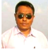
By: Sanjenbam Jugeshwor Singh

To fully answer the question, it would be crucial to understand certain perceptions and myths such as: Corruption is a way of life and nothing can be done about it, or that only people from underdeveloped or developing countries are prone to corruption. This is being stated with the irresponsible nature of the state machineries. Well, they have limitation to encroach at a central office but the law says that a citizen should be protected from death threat even if the person is a central government employee as it is now a law and order problem which is a state subject.