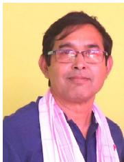
By: Rabin Prasad Kalita

As the ground became rock hard dry, therefore it was not easy to find forage for them. I made a habit of keeping a large tray of water, bread crumbs, and food grains daily for my visiting birds. The crazy birds played in the water with elation because there was no freshwater or open marsh nearby. I stood noiseless daily at a fixed time, to look upon a crowd of various birds while pecking grains. It pleased me seeing their shrieking at each other and also got entertained looking at their fights silently. They were trying to dominate over one another. A pair of waterhen was always in my notice while scavenging dawn to dusk. Both kept on moving around my courtyard over and over again until their tummy got full. During the entire winter, I made my backyard as a feeding ground for various birds', especially white-breasted waterhens.