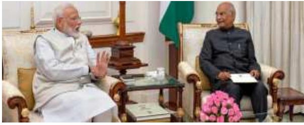
Gadkari were present on the occasion.

Mr Modi yesterday called on President Ram Nath Kovind and tendered his resignation along with his council of ministers. The President accepted the resignation and asked Prime Minister and his council of ministers to continue till a new government is formed. President Ram Nath Kovind hosted a dinner for the members of outgoing Council of Ministers at Rashtrapati Bhavan last night. Vice President M Venkaiah Naidu, Lok Sabha Speaker Sumitra Mahajan, Prime Minister Narendra Modi and Union Ministers including Rajnath Singh, Sushma Swaraj and Nitin