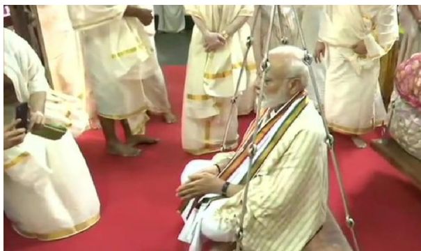
Agency New Delhi June 8,

Prime Minister Narendra Modi offered prayers at the Sri Krishna Temple in Guruvayur in Kerala Saturday morning in his first public appearance after his thanksgiving trip to his constituency in Varanasi. The Prime Minister who took a chopper from Kochi to Guruvayur came dressed in a mundu, traditional dress of Kerala. Outside the temple, a large crowd greeted the PM by chanting his name. At the temple he was weighed with