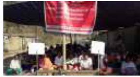
Anti CAB protest reaches far and wide; reaches interior villages; women bodies staging protest at Nongdam and Nongpok Heirok in Thoubal district