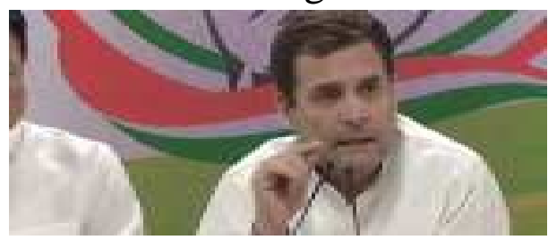
Agency New Delhi April 22,

Congress president Rahul Gandhi has expressed regret for attributing the 'chowkidar chor hai' remark against Prime Minister Narendra Modi to the Supreme Court.