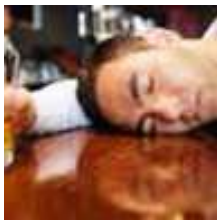
"The research has implications for people with PTSD who have an increased risk for over-use of alcohol and drugs," Dani said.

The findings may help develop treatment methods for individuals with post-traumatic stress disorder (PTSD), a mental disease characterised by impulsive behaviour and often heavy substance abuse.